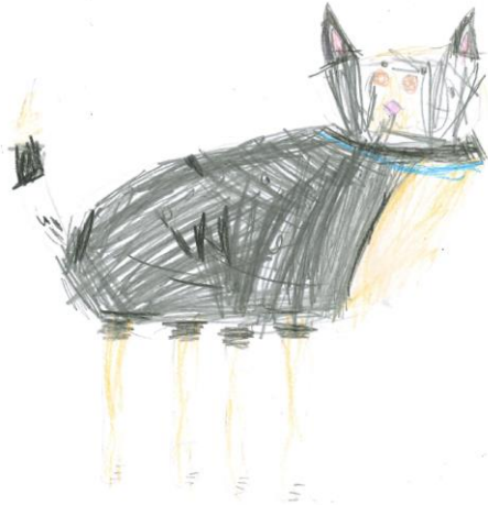
Rec - Penelope