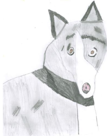
Year 4 - Emelia