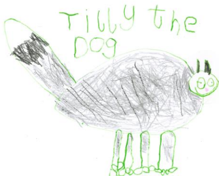
Rec - Elliott