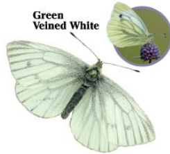
Green Veined White